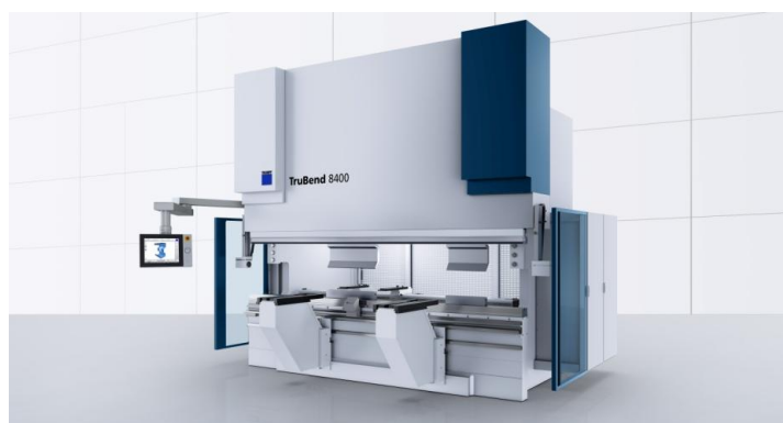
Big and strong as a stand-alone machine, too: the TruBend 8400