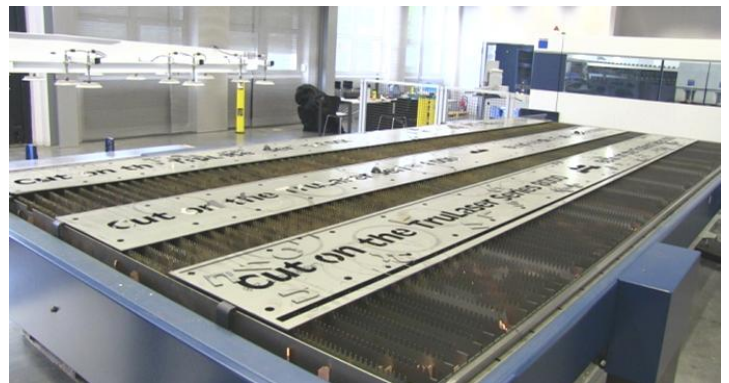
Laser cutting of the 6 m sample part