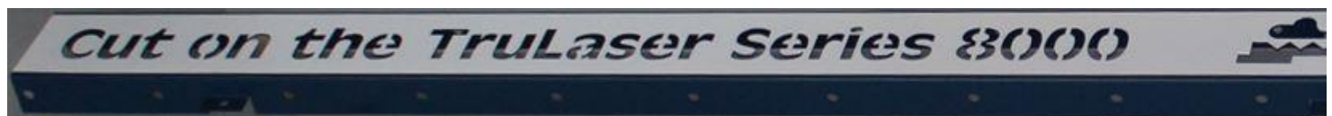
A 6 m sample part cut on a TruLaser 8000...