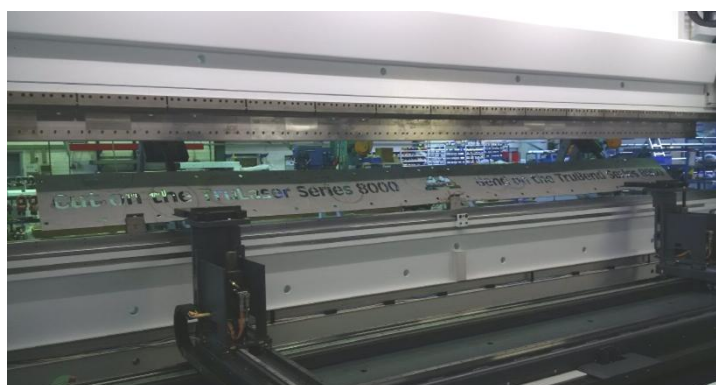
Bending the 6 m sample part