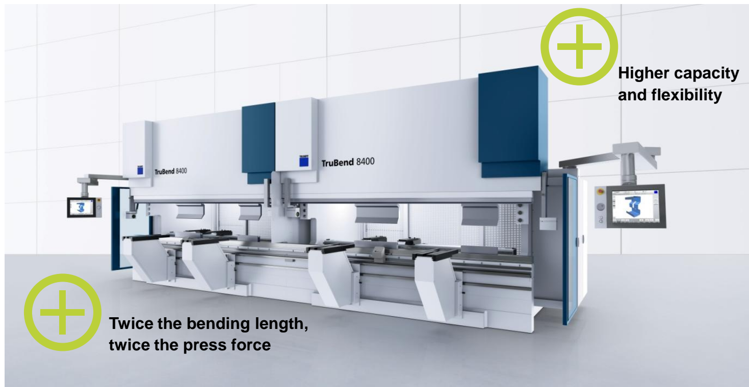
TruBend Series 8000 in tandem installation

Machines of the TruBend Series 8000 fulfill your requirements for precise production, versatility, high open height and a press force of more than 1,000 t. Bend oversized parts effortlessly, with two machines in tandem operation you can achieve bending lengths of up to 16 m. Different functions, such as the automatic crowning or the flexible lower tool displacement, enable optimal results also with oversized formats.