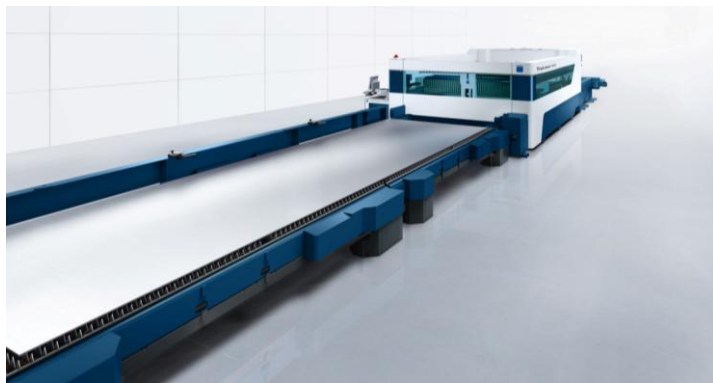
Cuts parts with up to 16 m in length: the TruLaser 8000